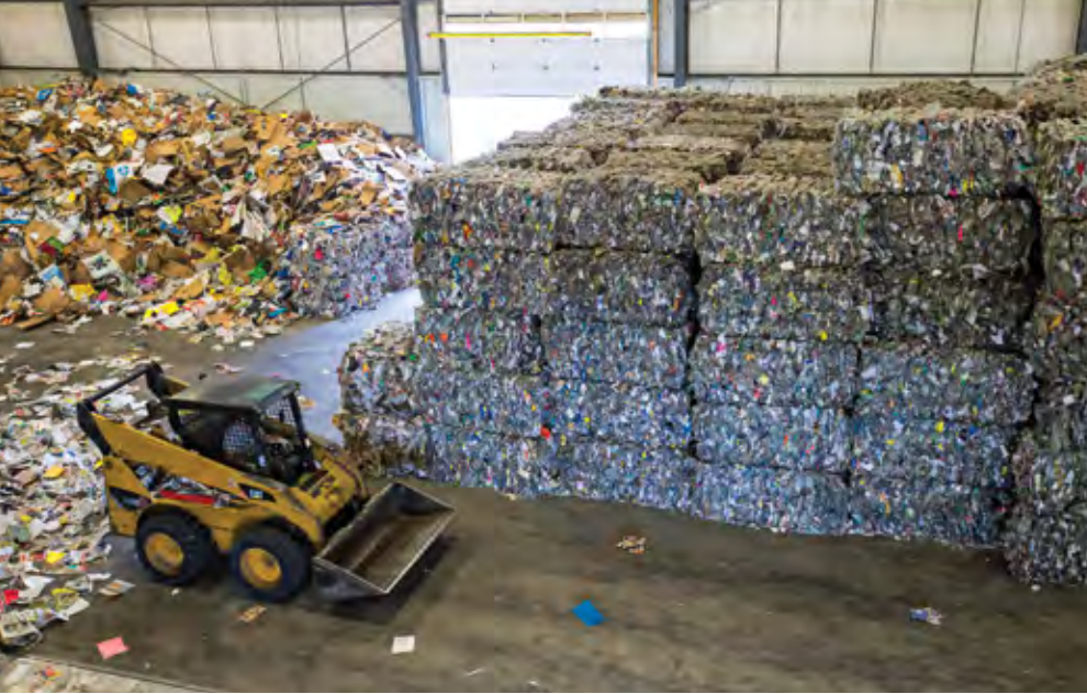
▲ Emterra Recycling and ▼ Loblaw, with its 1 million sq. ft. distribution centre, are among the seven clients at the GTH.

Ekstrom adds. At present, the GTH sees about 4,600 weekly truck movements.